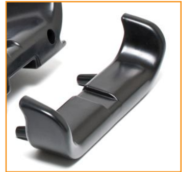
Seat Depth Extender