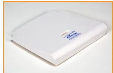
3-inch Extensor Thrust Wedge