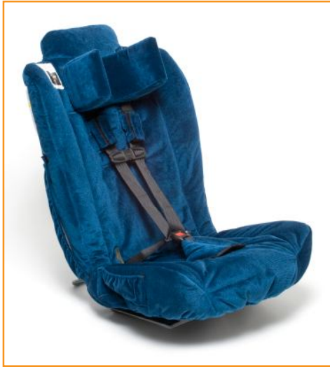
Standard configuration shown above