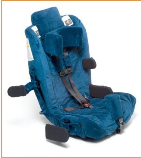
Shown above with accessories