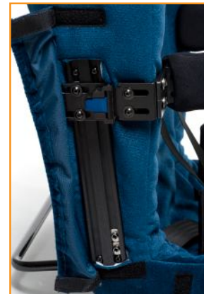
Swing-Away Trunk Support